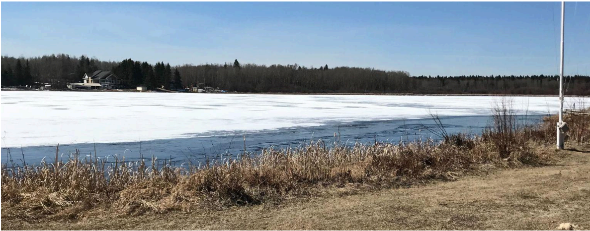
[Ice on Sunshine Bay, April 19, 2024]